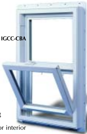
CVS-300 AAMA*101-97: R35/R25, IGCC-CBA

So you've decided to build your own home. You must be excited to be able to choose all the construction elements that will make it turn out just the way you want it. When you choose windows, you'll want quality, beauty, efficiency, economy, and easy installation. Crystal's Series 300 welded vinyl windows will fit your new construction needs perfectly. In short, you'll want Crystal.